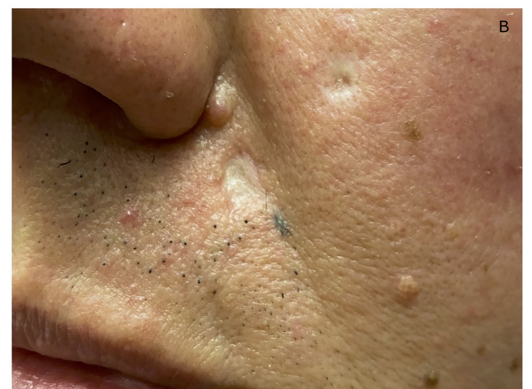
Fig. 1 - Case 1. Clinical presentation of cutaneous BCC located on the left nasal fold: (A) pre-treatment, (B) efficacy after 15 months of treatment with sonidegib 200 mg/die.